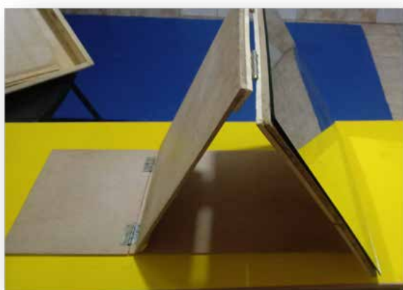
Figure 2. Mirror box